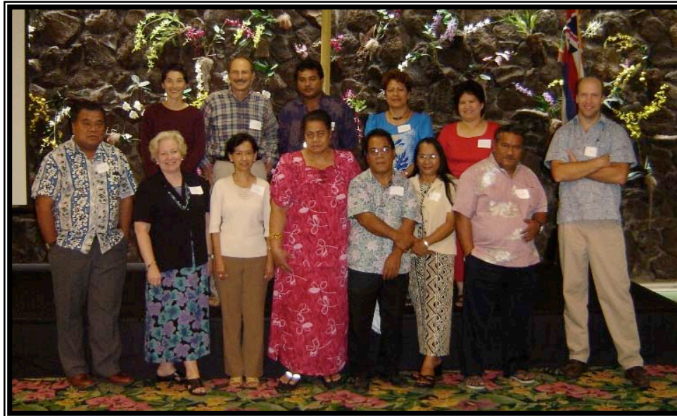
PIECCPP Coordinating Committee

The photos for this flip chart were contributed by the Republic of the Marshall Islands.