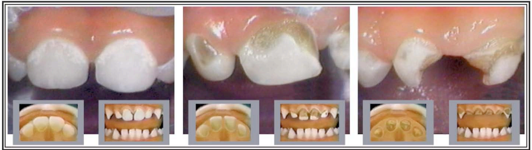
Very early decay